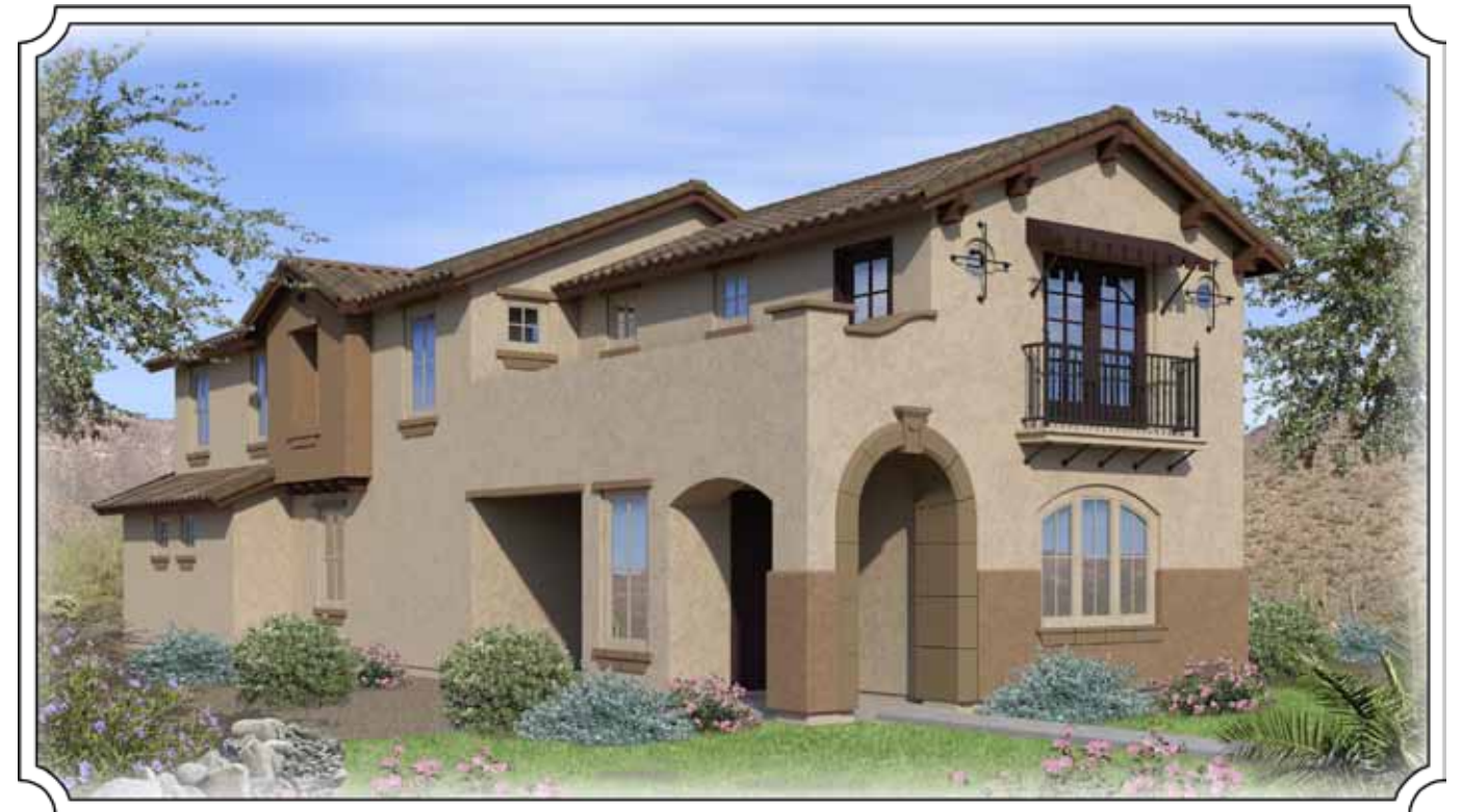
Spanish Mission Elevation

Floor plans, elevations, designs, materials and dimensions are subject to change without notice. Square footage and dimensions are estimated and may vary in actual construction. Floor plans and elevations are artist's conception and are not intended to show specific detailing.