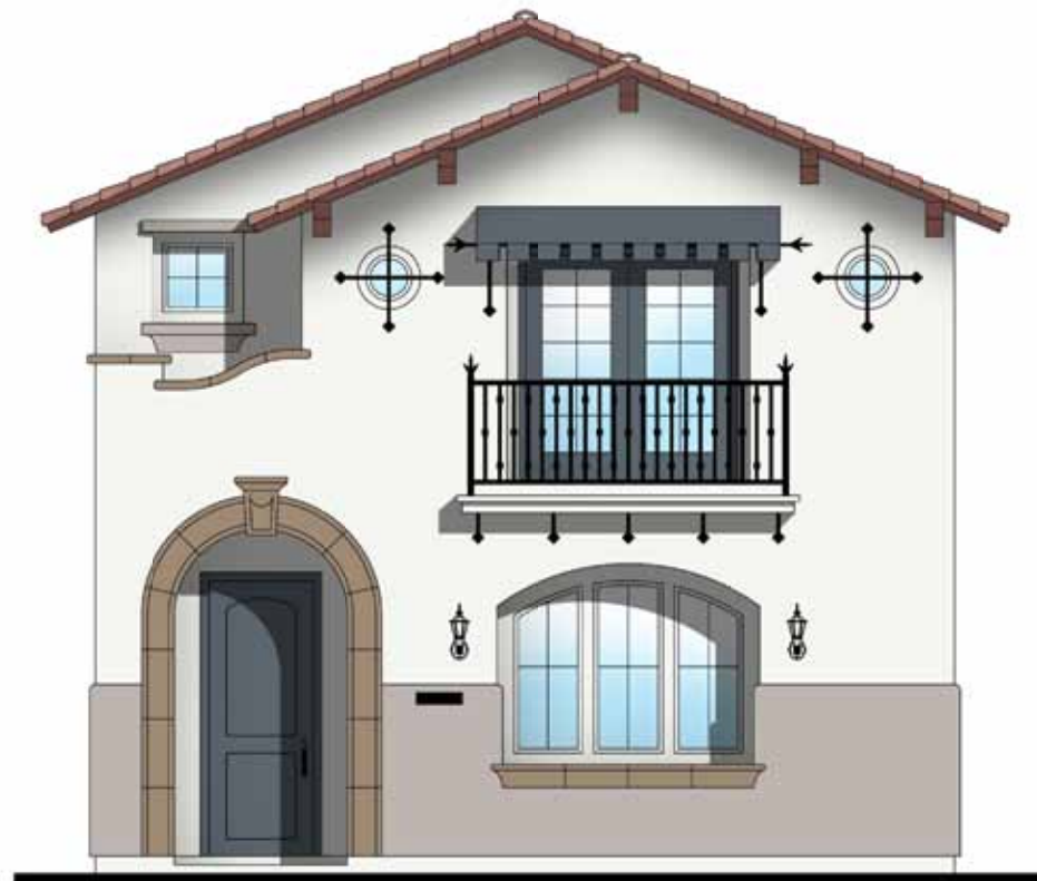
Spanish Mission Elevation

Floor plans, elevations, designs, materials and dimensions are subject to change without notice. Square footage and dimensions are estimated and may vary in actual construction. Floor plans and elevations are artist's conception and are not intended to show specific detailing.