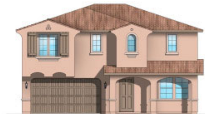
FRONT ELEVATION 'A'