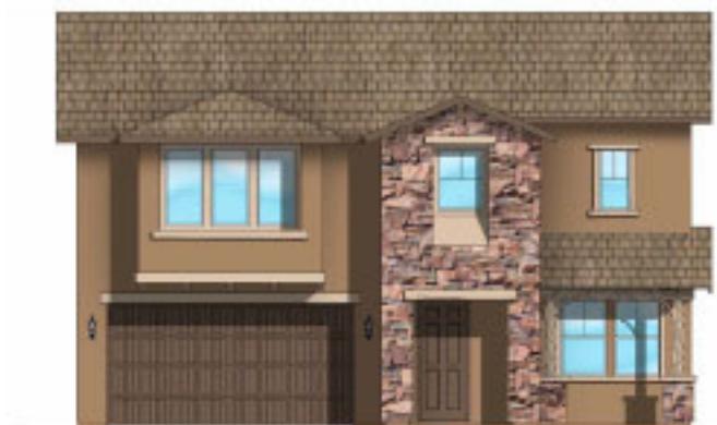
FRONT ELEVATION 'C'