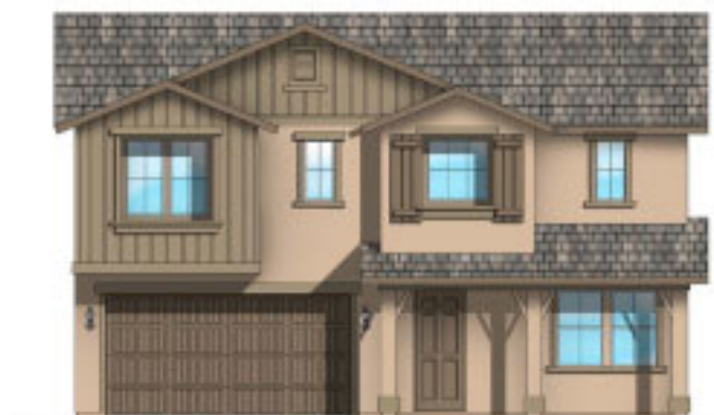
FRONT ELEVATION 'B'