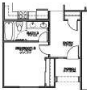
OPTIONAL BEDROOM 5 w/ BATH