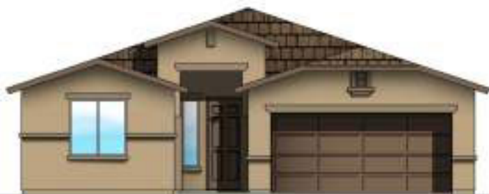
FRONT ELEVATION 'B'