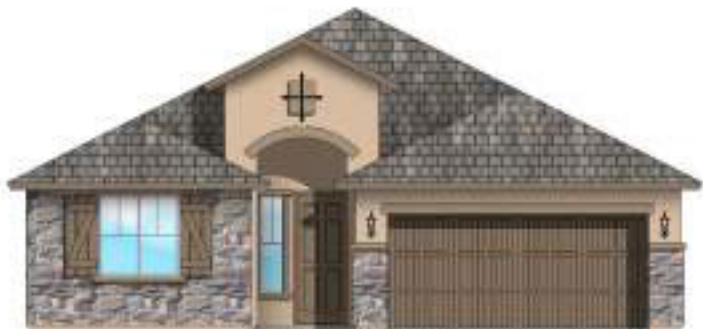
FRONT ELEVATION 'C'