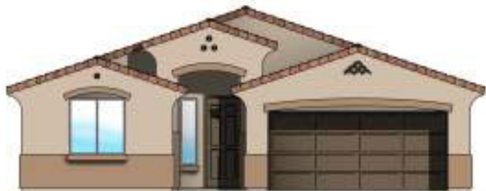
FRONT ELEVATION 'A'